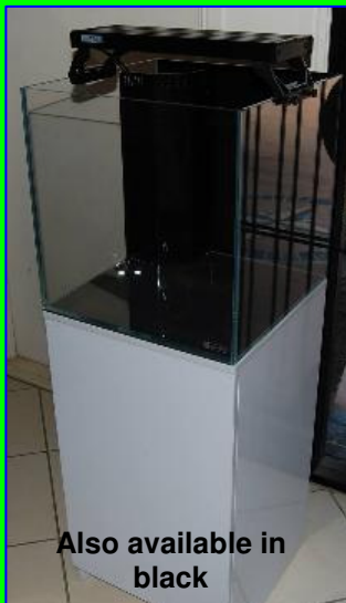
Also available in black