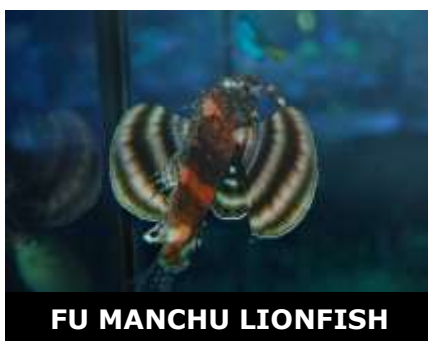
FU MANCHU LIONFISH