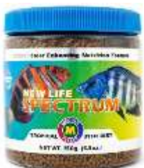
SPECTRUM MEDIUM PELLETT (2MM SIZE) FOR FRESHWATER & MARINE FISH. 150G.