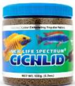
SPECTRUM CICHLID PELLETT (1MM SIZE) 150G.