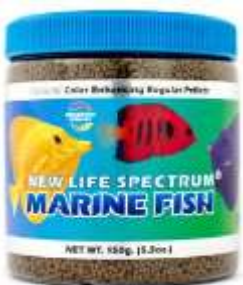
SPECTRUM MARINE PELLETT (1MM SIZE) 80G. AND 150G.