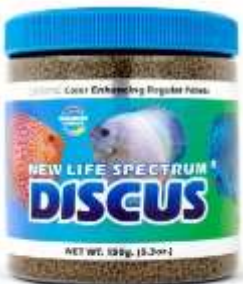
SPECTRUM DISCUS PELLETT (1MM SIZE) 150G.